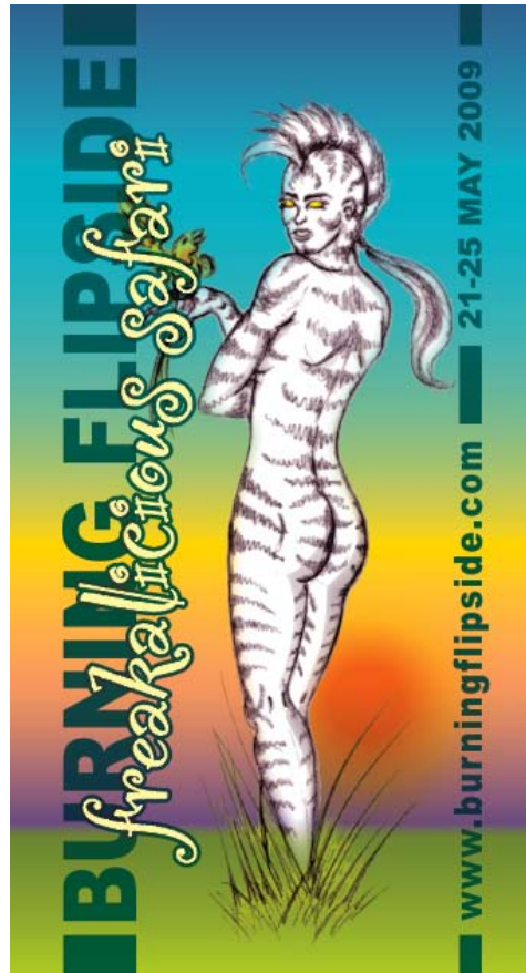
Ticket design art by Rodolfo Arredondo

Greeters has some late-night shifts we are still looking to fill! Want to host a swinging party, welcome some people Home and enjoy a day's worth of ill-gotten gains!?! Sign up at http://burningflipside.com/wiki/Greeters!